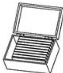
Slide box with 5 prepared slides & 5 blank slides