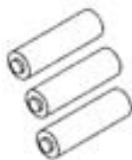
3 AA Batteries